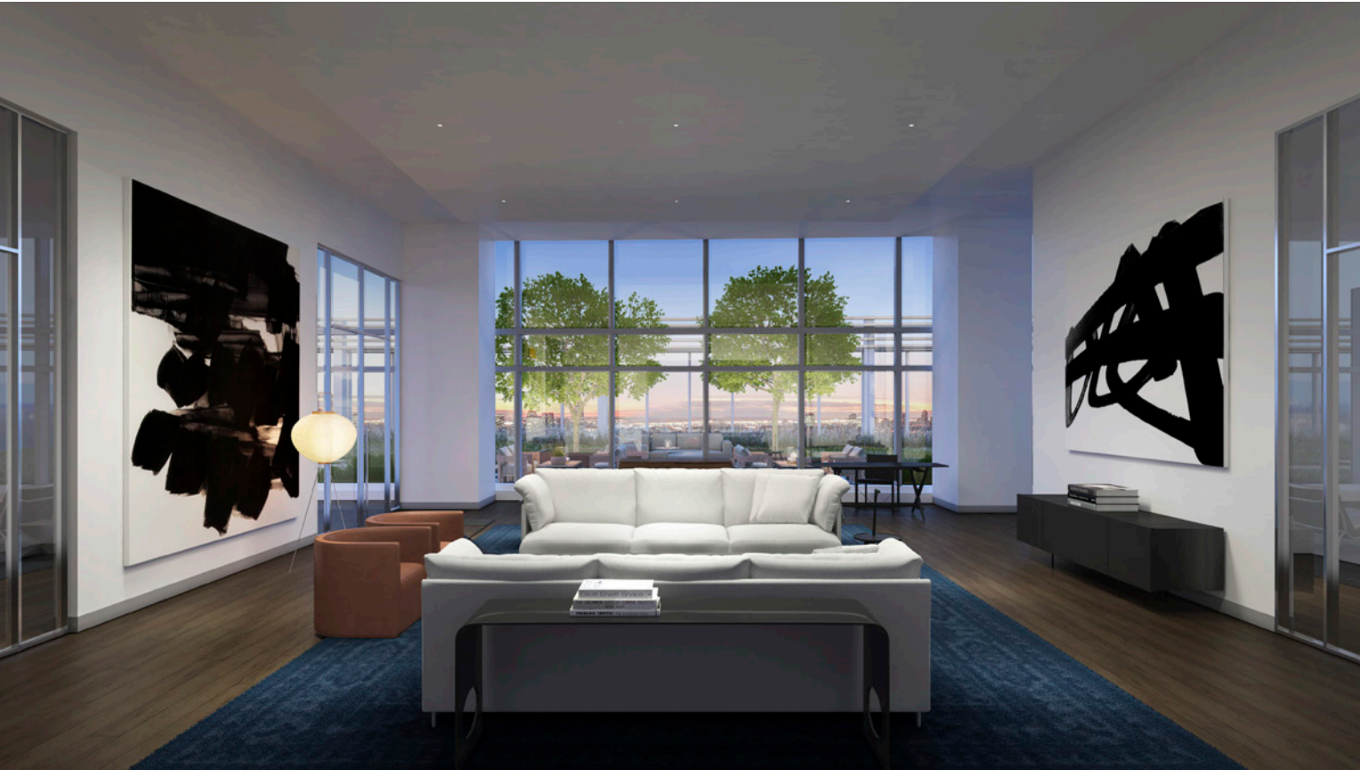
An airy and inviting lounge space for friends, private parties, or for use as an extended living room, is adjacent to the wellness center as well as a landscaped terrace with stunning city views.